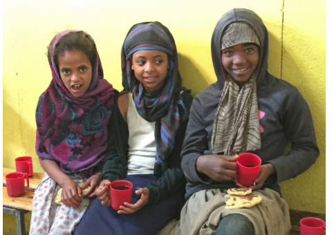
© 2016 Hope for Korah NEWS - Spring 2016