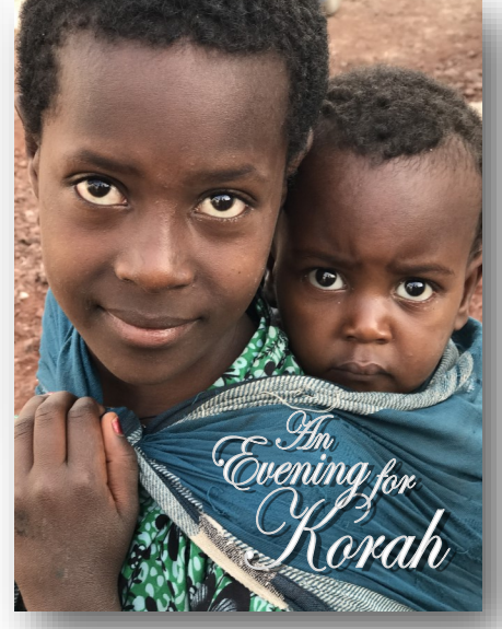
"An Evening for Korah" Fundraising Dinner & Auction OCTOBER 21st Abbotsford, B.C.