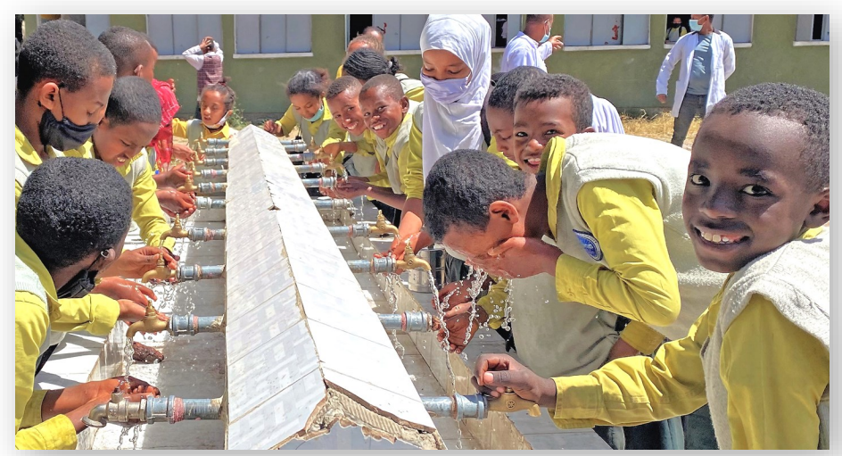
Water for the first time in two years - their faces say it all!