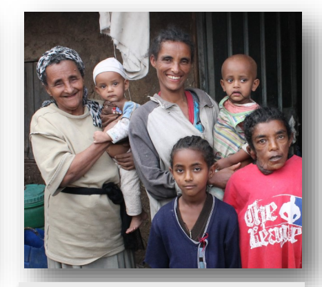
Senayet Family of 7