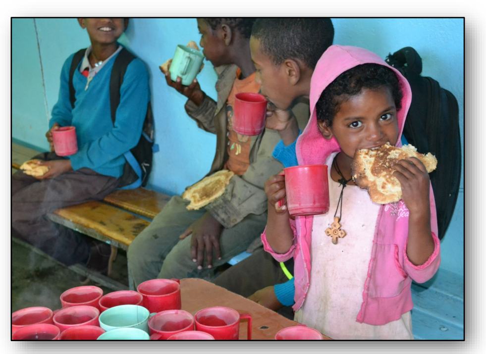
Serving Berta Pancakes to 275 children at our current Berta Breakfast compound.

Fig. B - Instead of food, the passerby offers a way out of the pit through a rope. But each individual must use their own strength in order to climb out.