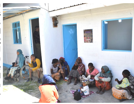
Families visiting the NEW Clinic

From its small beginnings as a backpack service, the health services of Hope for Korah now employs 3 local, full-time health staff and numerous others in support. Along the way, many foreign and local health professionals, along with Ethiopian government officials, have contributed their perspective and expertise on what kind of health service would best serve this community in helping families to break the cycle of poverty. Collectively, it